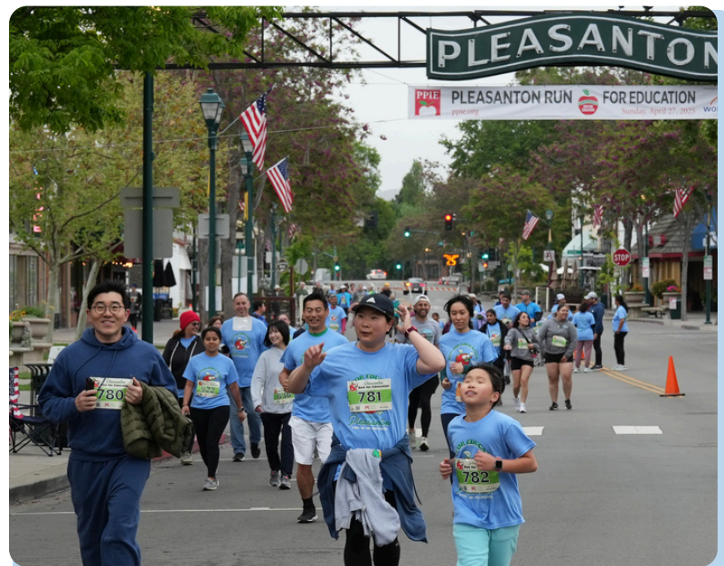
PPIE enlists 250 volunteers to host our annual Run.

Our 13th annual Pleasanton Run for Education continues to be our signature event! Raising over $100,000, we saw nearly 3,000 participants including runners, sponsors, volunteers, and spectators in person for a fun morning of community spirit. With over 50 sponsors there was something for everyone at our Race Expo. We were proud to highlight WORKDAY as our long term Presenting Sponsor!