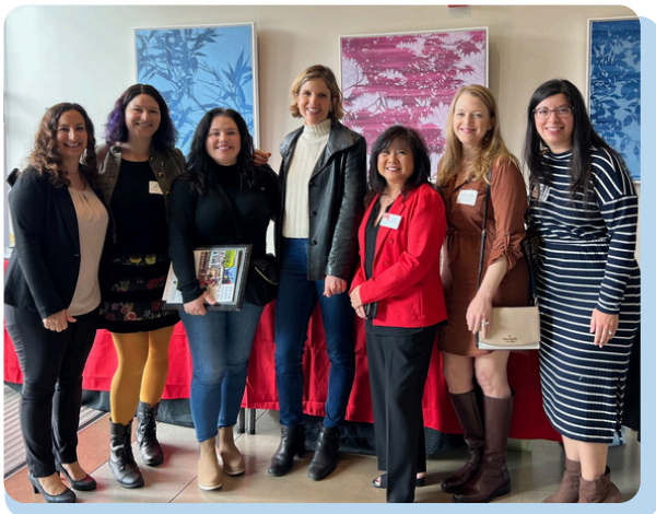
State of the School District 2025 at the Firehouse Arts Center with over 100 people in attendance.

In its 6th year, the State of the School event allows PPIE and PUSD to highlight the great work they do all year, as well as honor the businesses going above and beyond to support our schools and students. Held in winter, we awarded six local businesses the honor of being named a Pillar of Pleasanton for their continued support as community partners and their commitment to education in our community.