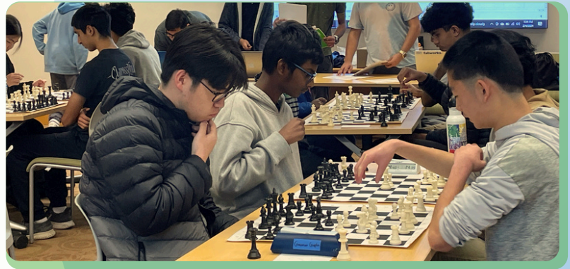
Student grant recipient - AVHS Chess Club

We want to thank all our families for their participation in funding our schools to see a full list of donors by school site go to ppie.org or click here .