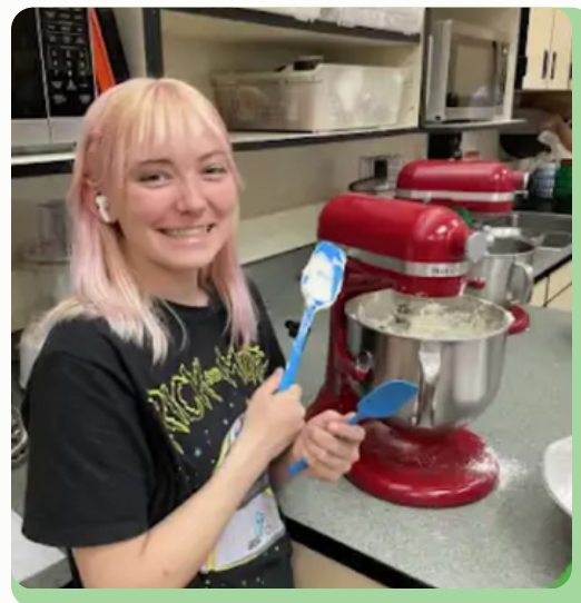
Student grant recipient - Catering Club at Amador Valley