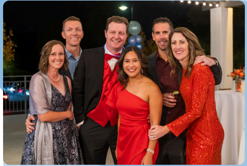
PPIE Fall Gala 2024, Castlewood Country Club.