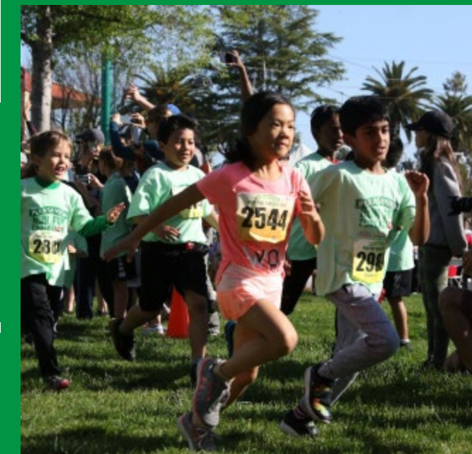
The 2019 Run for Education raised a record amount of money for the Pleasanton schools and students.

Our annual Run for Education brings 3,000 participants for a carnival atmosphere for all ages, including Oakland A's mascot Stomper who runs with 100s of children in the Kid's Challenge.